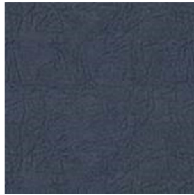
AK Prevail Blue #62116005