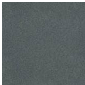
Prevail Grey #62116006