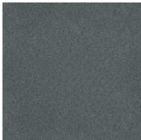
Fire Block 2000 Perma Guard #62000318