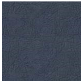
Prevail Blue #62116007